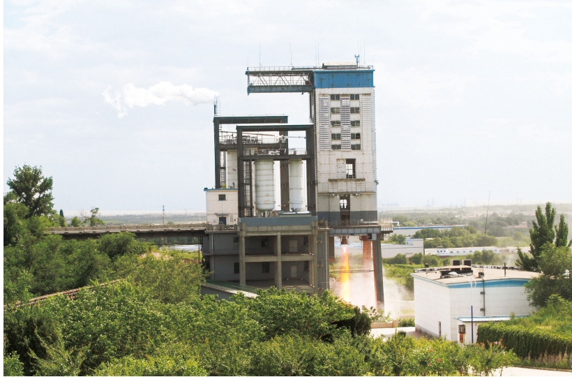
Figure 3: The ground test of the YF-77 LH 2 /LOX engine (Chen and Zhao 2020).

While the control system of YF-77 was shared by both thrust chambers, each single thrust chamber had five subsystems, including a propellant supply system, gas generator, ignition and start-up system, gas supply system for pressurization and servomechanism, and telemetry system (Figure 4). The single thrust chamber