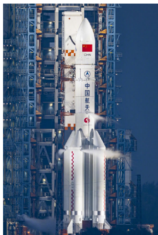
Figure 5.2: The CZ-5 launch vehicle with YF-75D and YF-77 LH2/LOX engines (CLEP 2019).