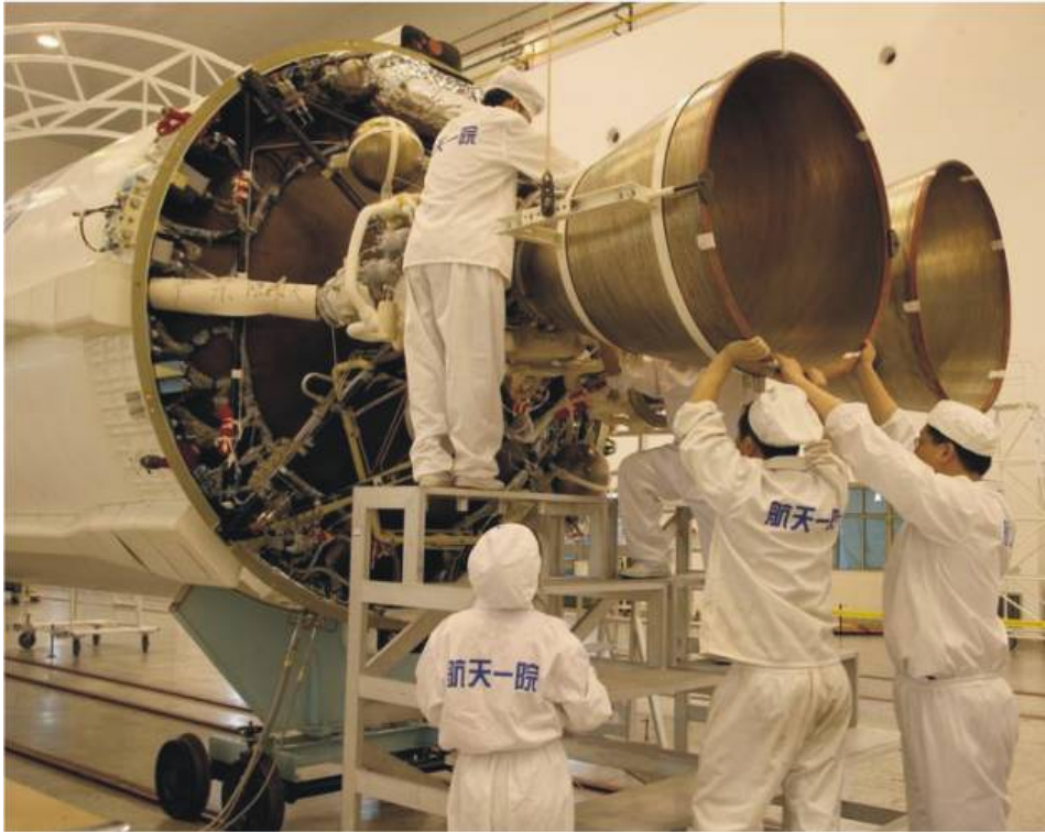
Figure 2: The installation of big nozzles for the YF-75 LH 2 /LOX engine (CASC 2010).

detailed analysis was also made of the inlet parameters of the two turbines, the flow coefficient of the nozzle, the expansion pressure ratio, the turbine efficiency, the split ratio of the gas flow, the pressure loss of the gas passage between the two turbines, and the mutual interference between the two turbines' parameters. With this, the turbopump experiment was completed (Yuan 1998).