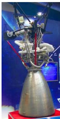
Figure 5.1: The YF-75D LH2/LOX engine (Editorial Committee. 2007, 175).

first flight of the CZ-5 launch vehicle, the hot-fire test of YF-75D was carried out for more than 45,000 seconds, and its failure-free hot-fire test lasted for more than 30,000 seconds, setting a new record for the development of launch vehicle engines in China. The vacuum specific impulse of YF-75D reached 442 seconds, and some technical parameters reached an internationally advanced level (Figures 5.1–5.3) (Li et al. 2017).