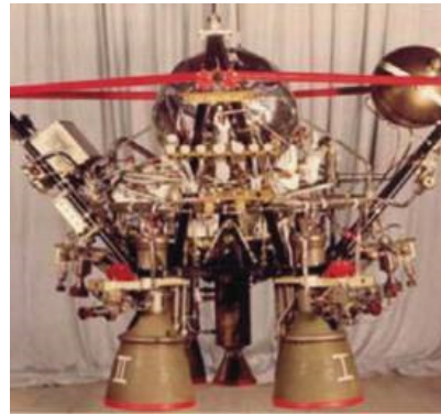
Figure 1: The YF-73 LH2/LOX engine (Zhang 2013, 1).

In order to find out the causes of the abnormality, scientists and technicians began devoting themselves to the fault analysis on the eve of the Spring Festival. At the successive analysis meetings, based on the interpretation, calculation, and analysis of telemetry data, a possible failure mode was put forward, and