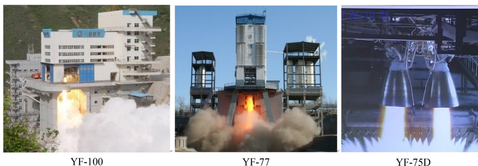
Fig. 3 Firing test of the rocket engine

LM-11 launch vehicle adopts a four-stage configuration with a length of 20.8m, a lift-off mass of 58-ton (in maiden flight) and a maximum diameter of 2.0m. LM-11 launch vehicle can be used to send 420 kg payloads into 700 km SSO orbits, or 500 kg payloads into 500 km SSO orbits, with a launch preparation time no more than 24 h [6] . The LM-11