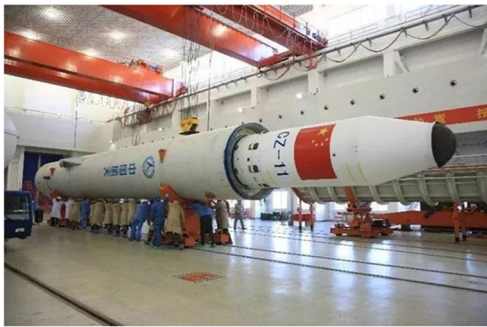
Fig. 4 LM-11 launch vehicle

launch vehicle is assembled, tested and transported horizontally, then entirely transported and erected, and finally launched vertically, as shown in Figure 4. It finished its virgin launch successfully in September 2015.