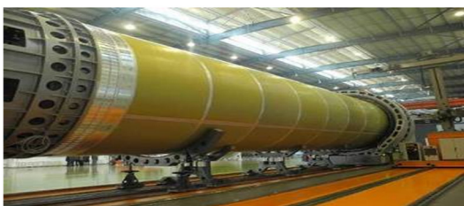
Fig. 2 5 m diameter lightweight cryogenic tank

(5) Highly reliable electric system scheme. The redundancy strategy of dynamic isolation is adopted in the control system. Moreover, the system-level redundant scheme is adopted for the first time, solving technological problems of redundant judgment and fault isolation. The real-time uninstall, active guidance and shut down estimation technologies are adopted in the guidance control system, which noticeably